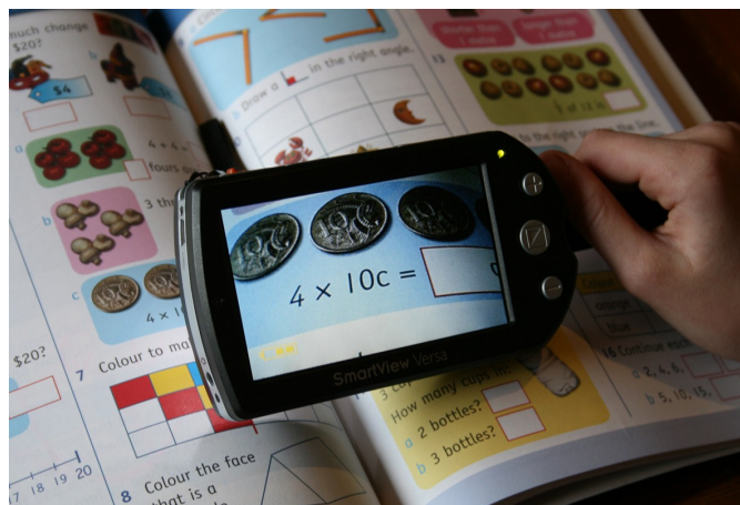
Hand Held CCTV, Smartview Versa.

for instance, will it work in an Australian setting e.g. can you change the adaptor plug?